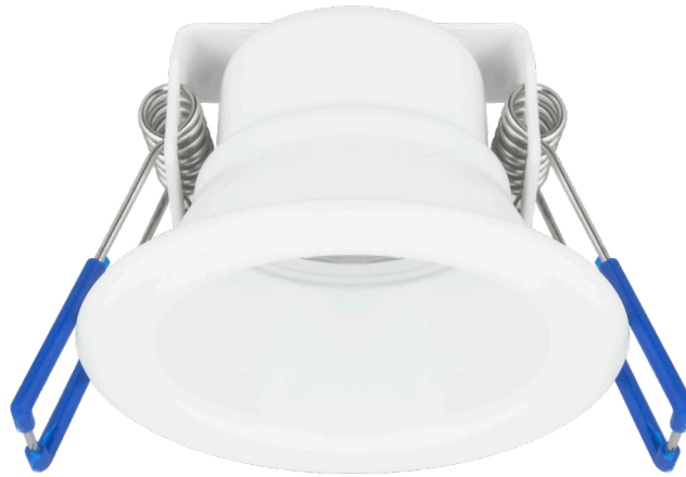
Epiq Direct 2 Round - White Multiplier