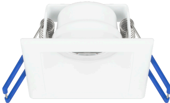
Epiq Direct 2 Square - White Multiplier